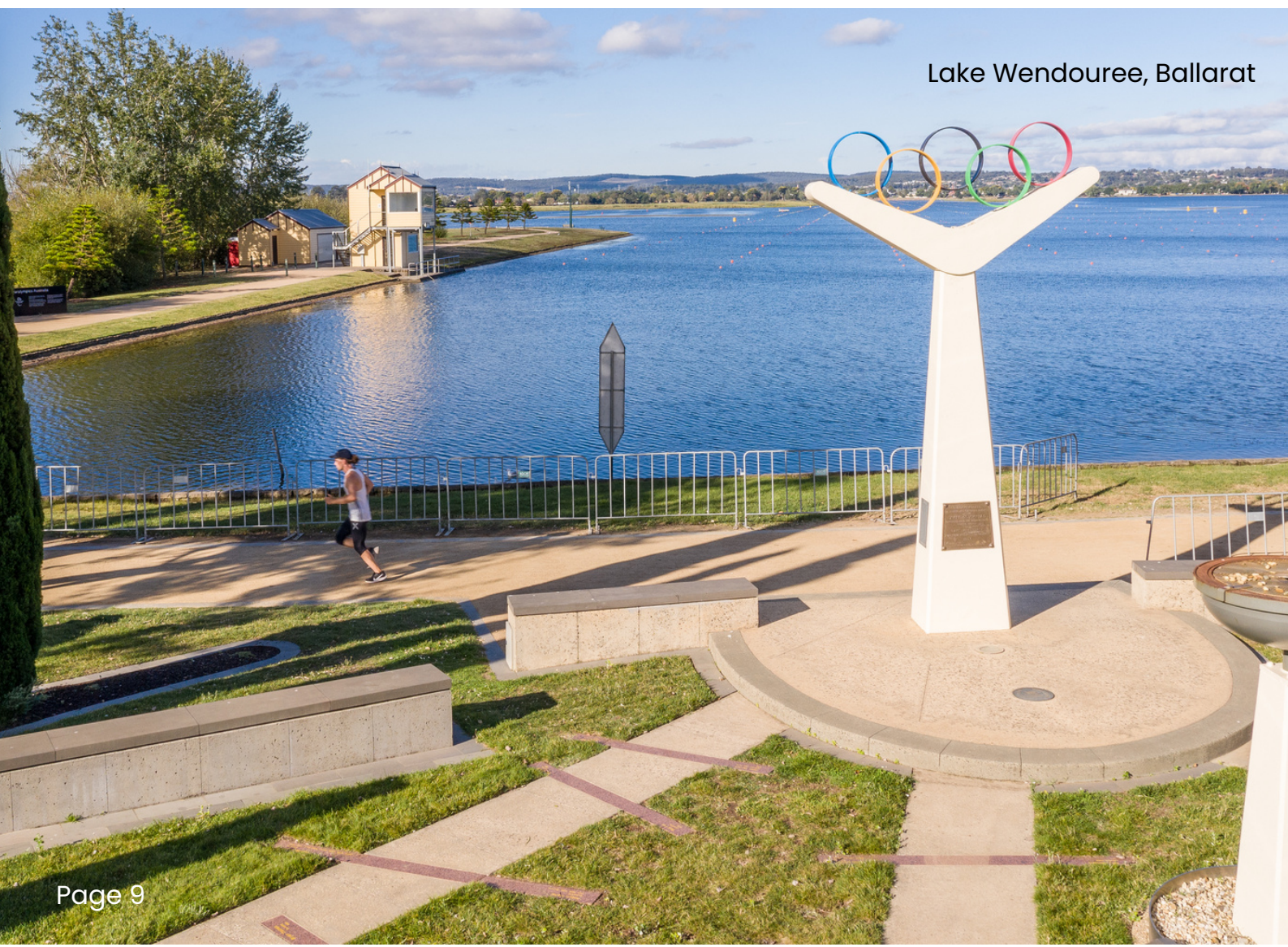
Lake Wendouree, Ballarat