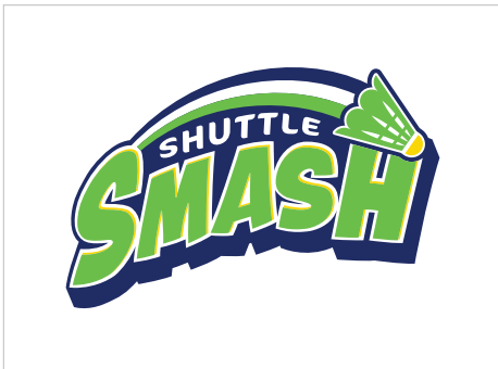
PMS - Positive Version