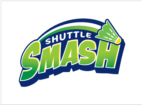
CMYK - Positive Version