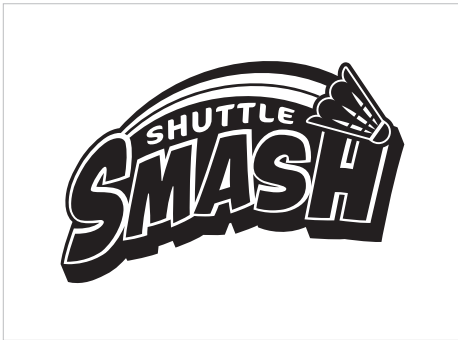
Mono - Positive Version