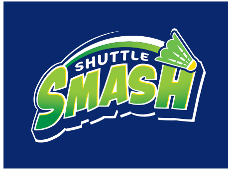
CMYK - Reversed Version